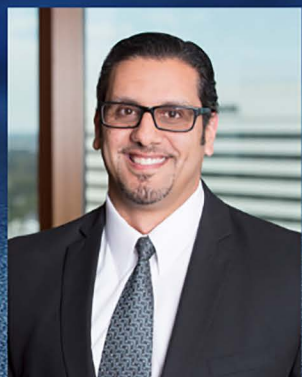
Hani Sayed Intellectual Property