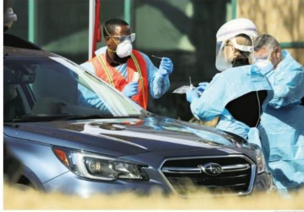
A disinfection team in Tennessee on Wednesday as the effects of the coronavirus pandemic began to come into stark relief.