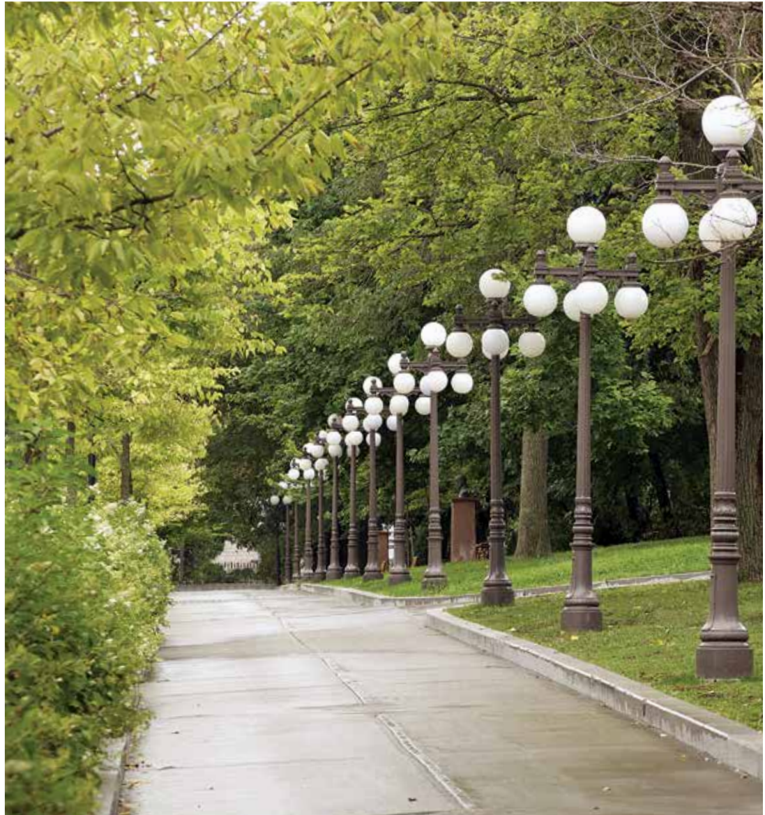
LAMPS ALONG A WALKWAY IN OLD QUEBEC CITY

Canada's Top 100 Employers ( www.canadastop100.com )