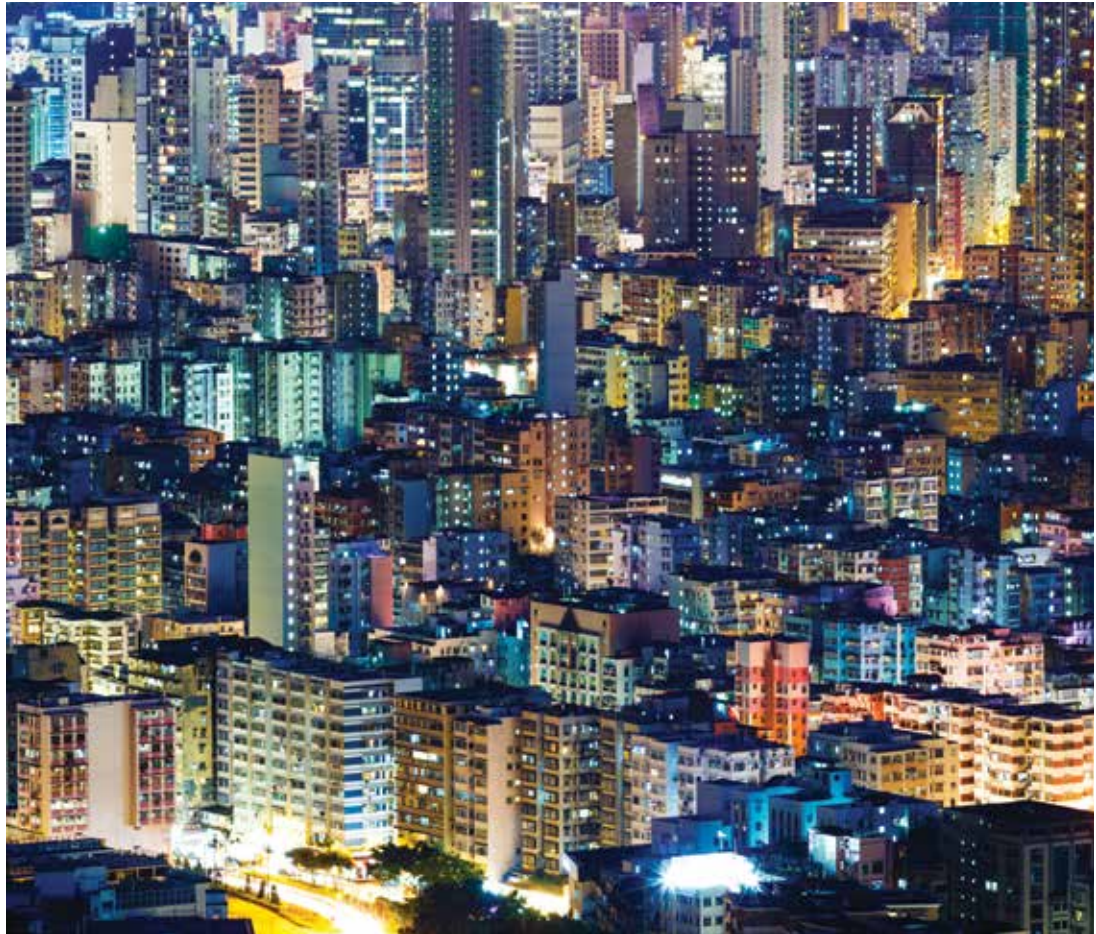
HONG KONG CITYSCAPE

Hong Kong Trade Development Council: www.hktdc.com