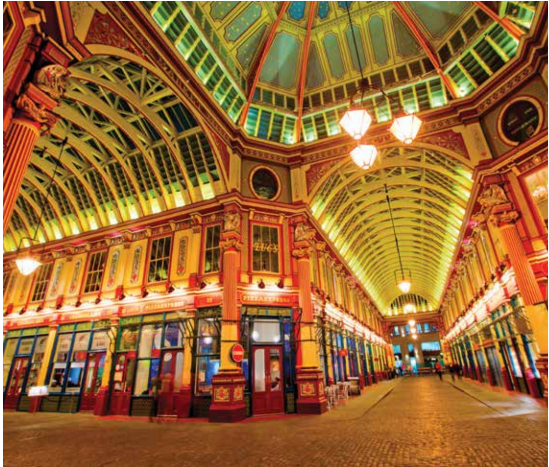
LONDON, ENGLAND FEB 13: THE FAMOUS LEADENHALL MARKET

UK Legislation ( www.legislation.gov.uk/ )